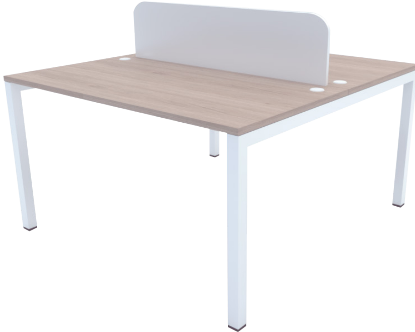
Table Top Size Options (mm)

The Hermes 2-Way Workstation pairs clean, modern design with dependable performance. Built with sturdy, powder-coated square tubular metal legs, it offers excellent durability and stability for everyday use. The 2-way layout supports focused teamwork while maintaining personal space, with optional screen panels available for added privacy and acoustic comfort. A sleek, versatile solution for compact offices and collaborative setups.