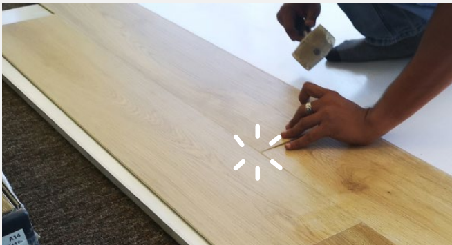
Click installation (glueless)

a - 1235mm : b - 178mm : c - 5mm (pre-attached 1mm underlay)