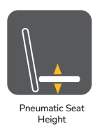
Pneumatic Seat Height Adjustment