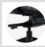
Advanced Knee Tilt Mechanism