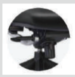
Synchronized Tilt Mechanism