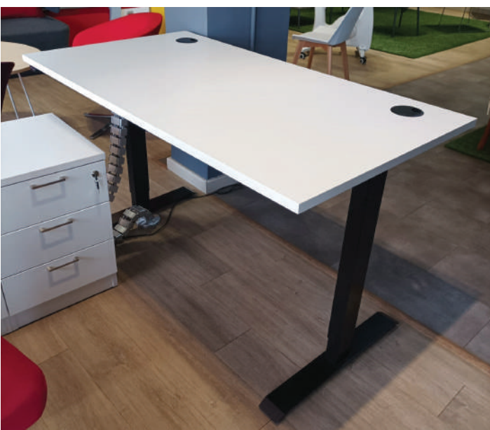
ERG21 with one motor and a black frame