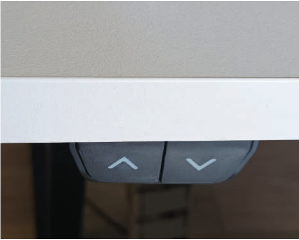
Up/Down arrows for controlling the table heights